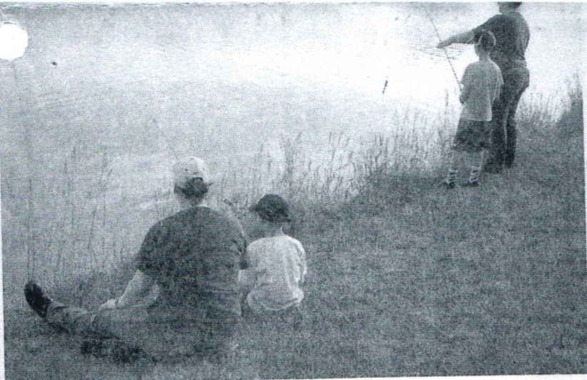
TAKE-A-KID-FISHING EVENT: It couldn't have been a nicer evening for the McCook County Wildlife Club's annual Take-A-Kid-Fishing event at Lake Vermillion. Kids from Salem, Spencer, Montrose, Bridgewater and Canistota were in attendance. Above, the kids try their hand at everything from baiting the hooks, to casting the rod, to reeling in their catch. Members of the SD GF&P and the McCook County Wildlife Club helped the young anglers with their fishing.

utilize excess moisture, cover crops can alleviate future moisture issues.