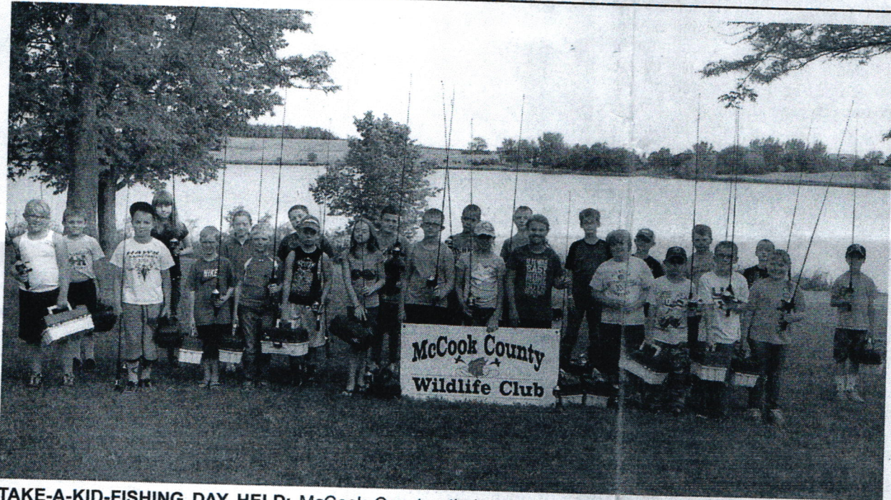
TAKE-A-KID-FISHING DAY HELD: McCook County Wildlife Club held their annual Take-A-Kid-Fishing Day last Thursday at Lake Vermillion. Around twenty-five kids from Salem, Spencer, Montrose, Bridgewater and Canistota were in attendance. The event is sponsored by the club using proceeds from its annual fishing derby held each year on the Missouri River. The kids are chosen by application. The club hopes to introduce the sport of fishing to this younger generation in hopes of them finding an interest in it. Fishing poles, tackle, and tackle boxes are given to all the participants and are