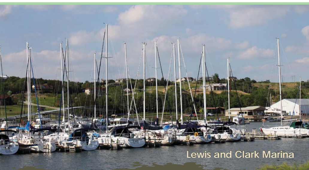
Lewis and Clark Marina

Modern cabins and lodge-style accommodations; cafe; bait and convenience store; boat rentals; courtesy dock